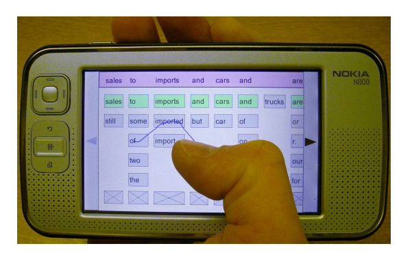
Figure 1. The Parakeet system running on a Nokia N800 device.

Copyright is held by the author/owner(s). IUI'09 , February 8-11, 2009, Sanibel Island, Florida, USA. ACM 978-1-60558-331-0/09/02.